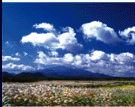
Autumn of Jeju with Blue Sky And Crispy Air