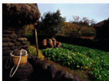
Traditional House Showing the Lives of Jeju Women