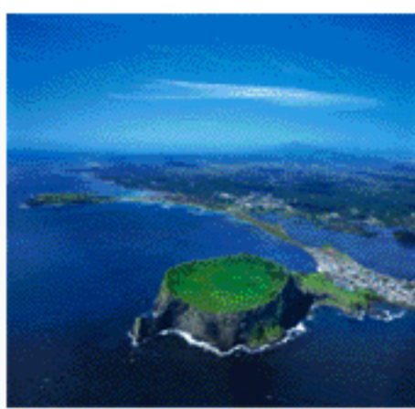
Seongsan Ilchulbong UNESCO's World Heritage