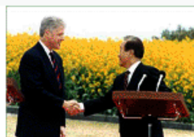
Former U.S. President Clinton Visited Jeju