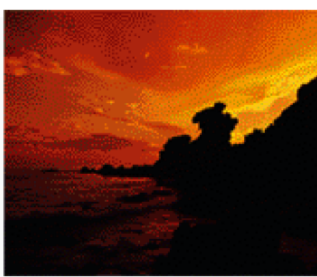
Beautiful Sunrise from Yongdum Rock