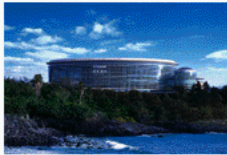
World Class Convention Center ICC JEJU with a View