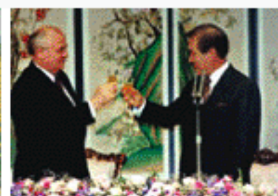
Former U.S.S.R. Prime Minister Gorbachov Visited Jeju