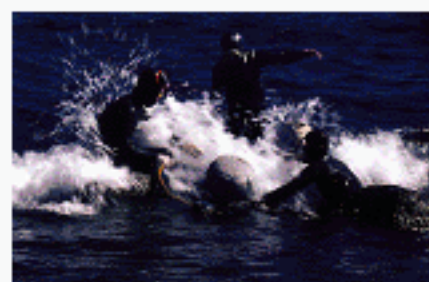
Haenyeo (Women Sea Divers) Jeju's Professional Women

Jeju is also known as an ideal place for world summit meetings. Many world leaders have visited Jeju and acclaimed for beauty of the island as well as its spirit of peace.