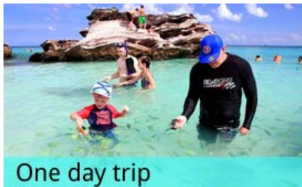
One day trip

Option Join tour: 03 November 2018 (Start from 07.30 am-16.30 PM) Full day Phi Phi Island+Maya bay+Khai Island by speedboat